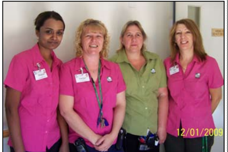
Sunlight staff wearing their new uniforms

It is wonderful to see the staff in uniforms, they look great. I have received some great feedback from the staff when I visit the homes, about how great they are to wear.